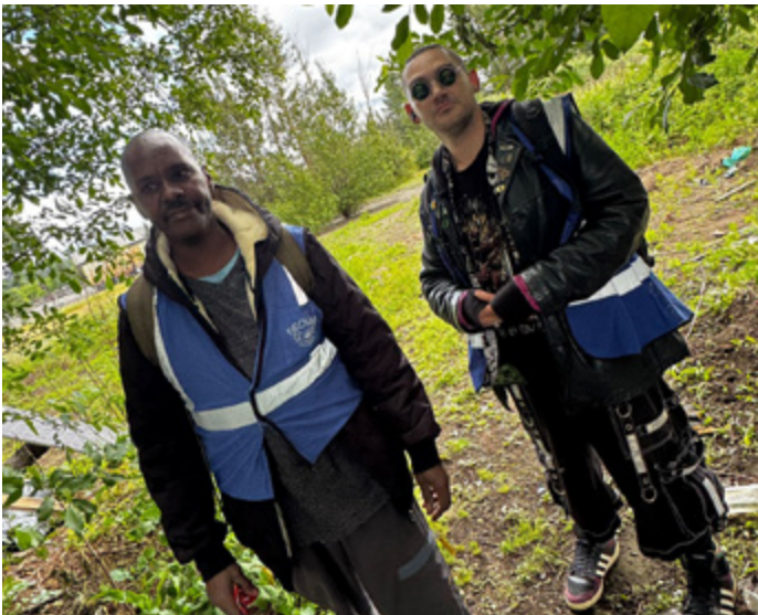
Ground Score Outreach Workers

Funded by Metro and administered by the Portland Harbor Community Coalition through the North River Roots Community Grant, this project also generates high quality, low-barrier work for residents of Hazelnut Grove – a tiny home community of formerly unhoused individuals and people living with disabilities. The initiative has already dedicated 238 combined staff and volunteer hours to sowing over 490,000 seeds and planting 316 native species on the hillside.