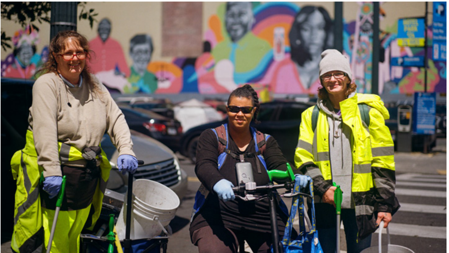
GLITTER workers running bagless waste collection with reusable bags.

Members have the quarterly opportunity to attend General Assemblies to vote on policies, elect Workers Council representatives (every 2 years) and meet for a shared meal. This bottom-up approach empowers our members to take ownership in Ground Score and seek out pathways to stability, leadership, and growth.