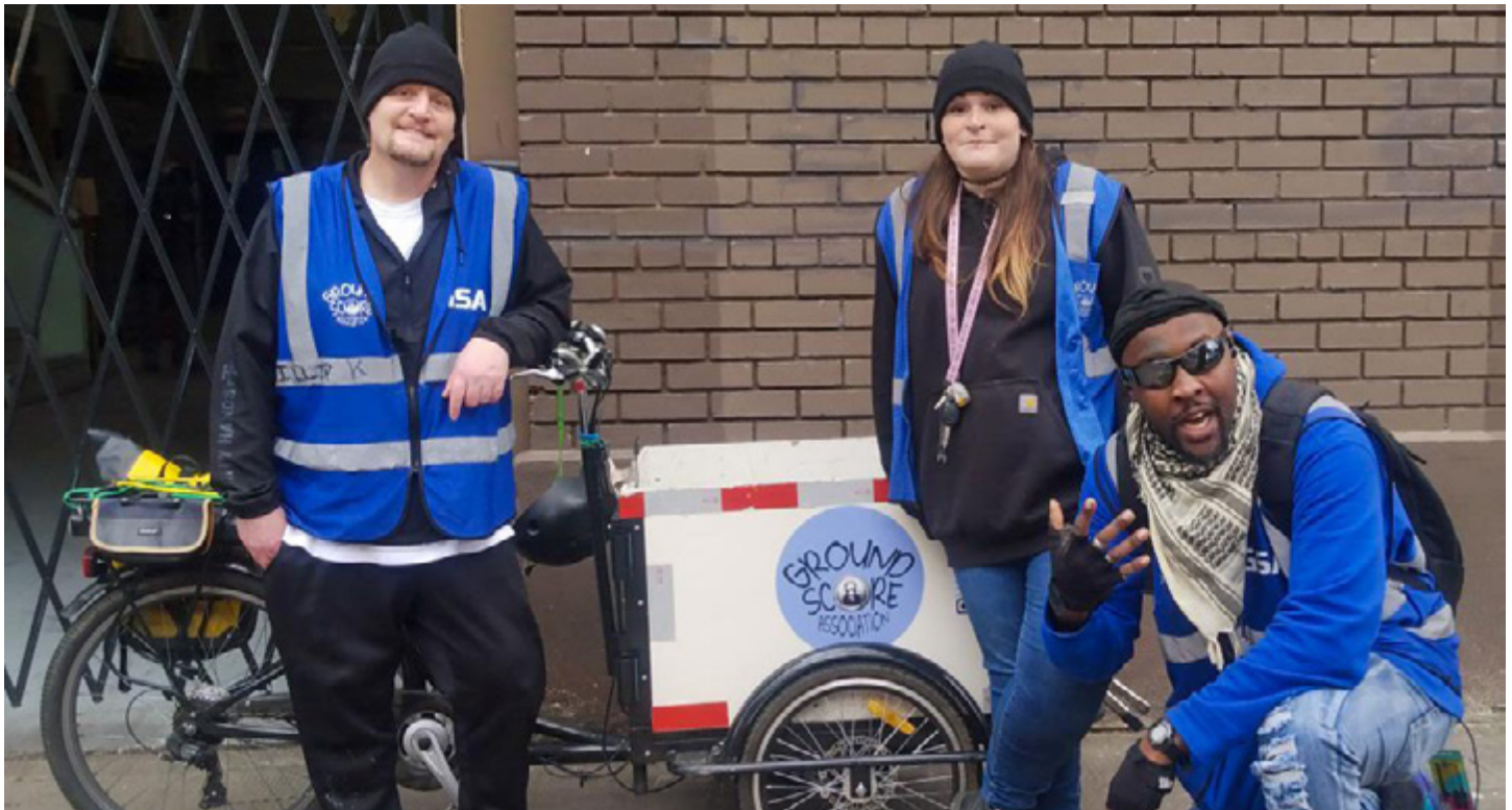
GLITTER e-trike workers

81% of workers report health improvements, with the percent of workers who report struggling with drug abuse dropping from 48% to 12%, as a direct result of working for Ground Score.